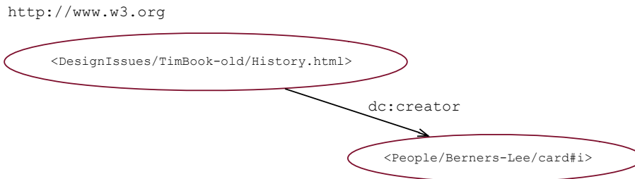
Figure 1. An RDF triple